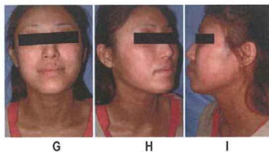
Figure 2. A case involving treatment of the facial surface and neck with ERI lotion, steroid/antibiotic combination ointment and vitamin E/A ointment. (A)-(C): 1 month after treatment; (D)-(F): 1.5 months after treatment; (G)-(I): 3 months after treatment. (A), Front side; (B), Right side; (C), Left side; (D), Front side; (E), Left side; (F), Rear side; (G), Front side; (H), Right side; (I), Left side.